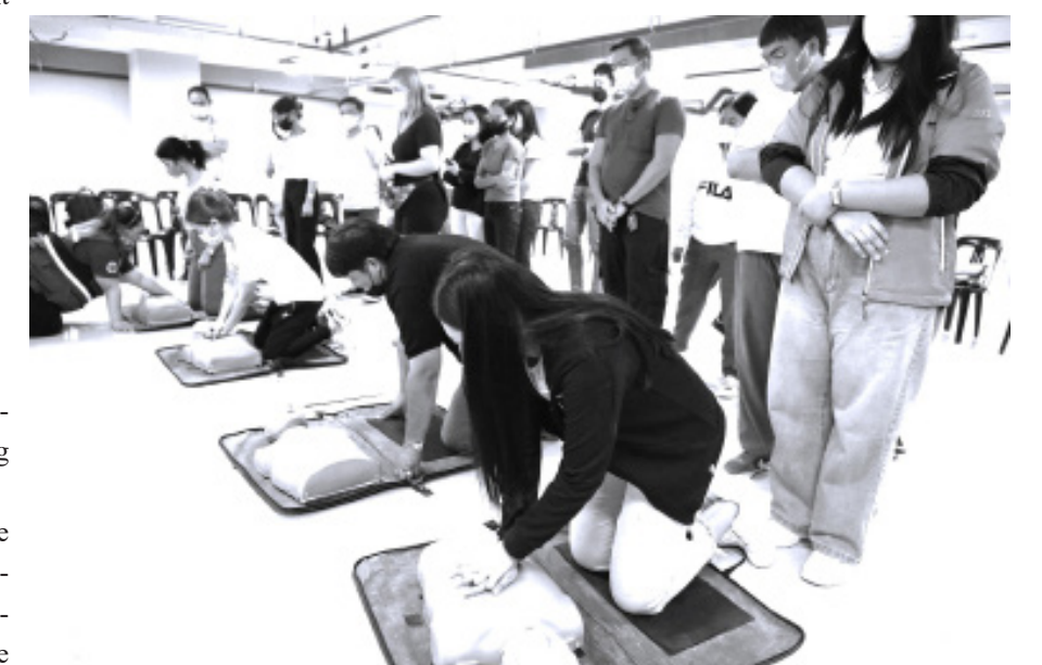
Sa temang "Bidang Pilipino: Building A Stronger Filipino Well-Being Towards Disaster Resilience," ibinahagi sa 33 katao ang tamang paraan ng splinting at bandaging, pagsasagawa ng CPR (cardiopulmonary resuscitation), at pagbibigay ng first aid sa taong nabubulunan. Ang nasabing training ay bahagi ng pakikiisa ng CDRRMO sa National Disaster Resilience Month.

Inilunsad ang First Aid and Basic Life Support Training for Public ng Imus City Disaster Risk Reduction and Management Office sa Wellness Center ng Imus City Government Center.